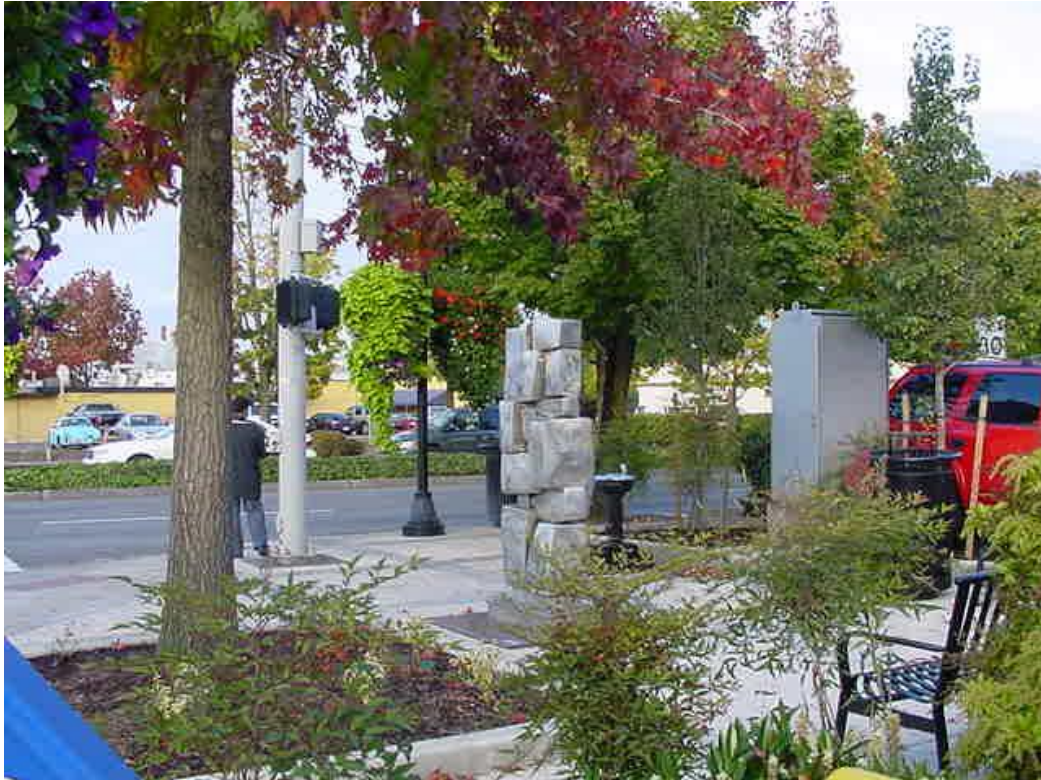
Artwork in downtown Beaverton