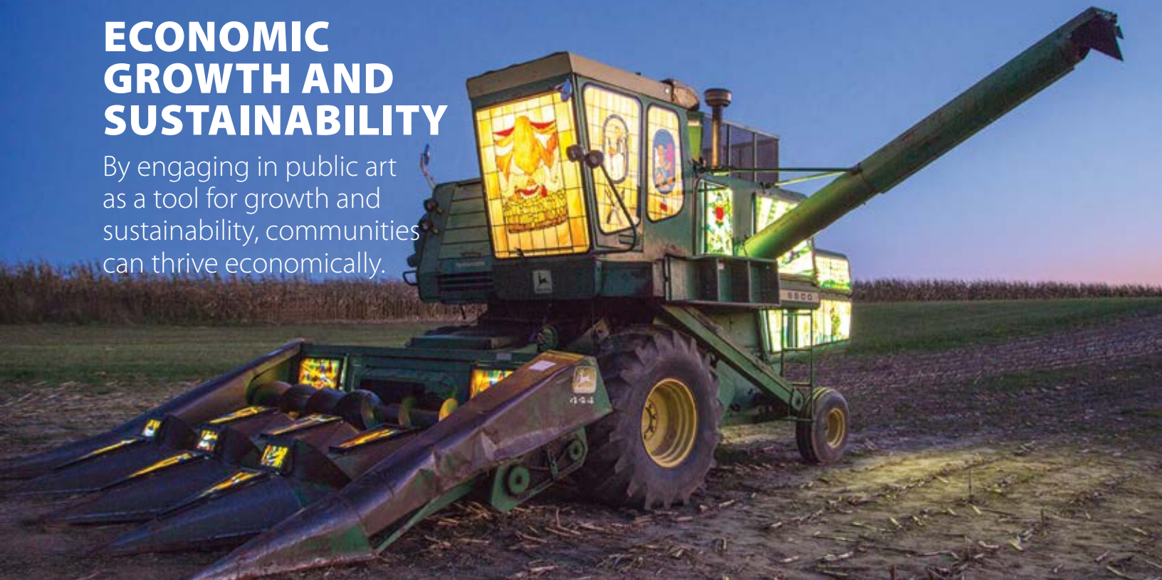
Karl Unnasch's sculpture "Ruminant (The Grand Masticator)." Installed in Reedsburg, WI as part of the Farm/Art DTour public art roadside tour, 2015.

By engaging in public art as a tool for growth and sustainability, communities can thrive economically.