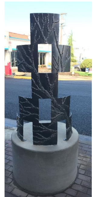
Public Art on Broadway