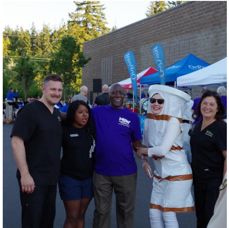
Neighbors Southwest – Neighbors Night Out