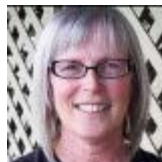
Brought to you by Ginger Rapport - Beaverton Farmers Market - FARMERS MARKET INSIDER -