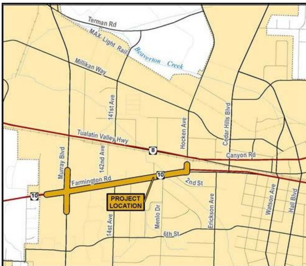
A depiction of the project area.

By clicking "Subscribe", you agree to our Terms of Use and Privacy Policy .