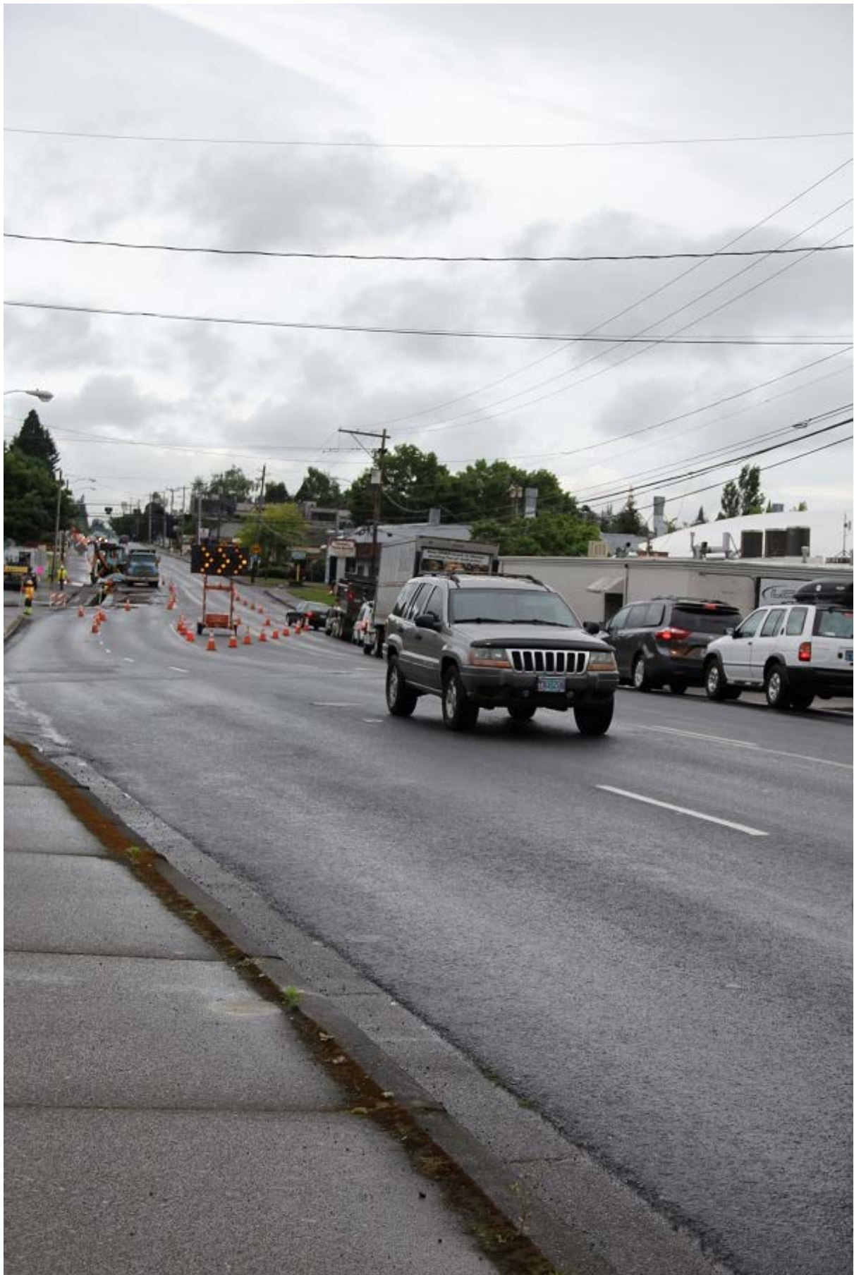
The Farmington Road Project began in April 2015 and included the widening of Farmington, the installation of bicycle lanes and sidewalks, realignment of 141st and 142nd Avenues, and upgrades to water and sanitary sewer lines.