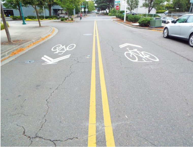
Caption: The City of Beaverton recently completed Canyon Road alternate bike routes, the routes included marking sharrows on the roadway. Sharrows are shared-lane markings to indicate where people should cycle.