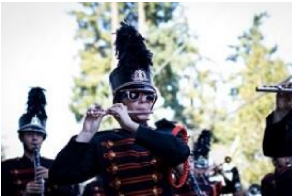
Caption: The City of Beaverton will be held on Saturday, Sept. 10 at 10 a.m. in downtown Beaverton. Grab a seat along the parade route from Allen Blvd to Erickson to 5 th Street. ( Map/City of Beaverton )