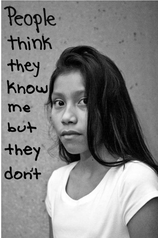
Caption 2: Photographs and interviews for the Hello Neighbor project are by local youth through HomePlate Youth Services. The project was installed around Beaverton this week.