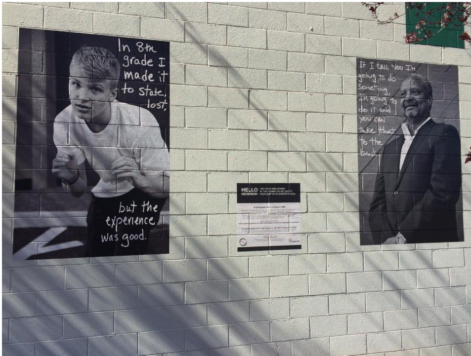
Caption 1: The Hello Neighbor project was installed around Beaverton this week, including at the Beaverton Activities Center (pictured). The project brings neighborhoods together through photography and conversation.